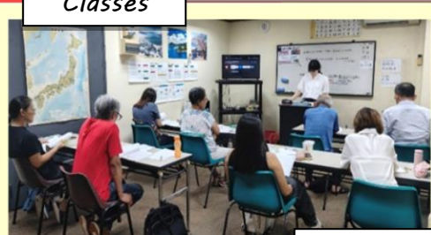
Break time between classes