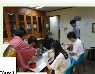
Sado Class (Tea Ceremony Class)

You will learn Japanese culture and customs through various activities.