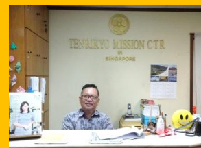
(Above) Cultural Section