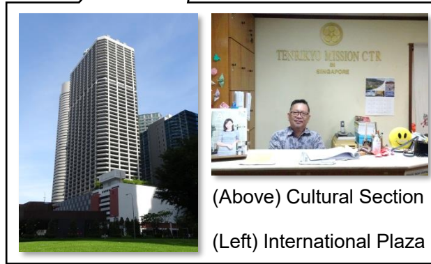
(Above) Cultural Section