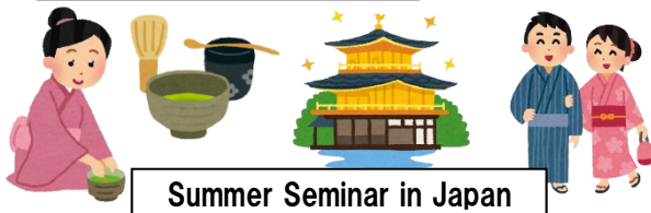
Summer Seminar in Japan